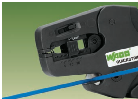
Cutting of wire.