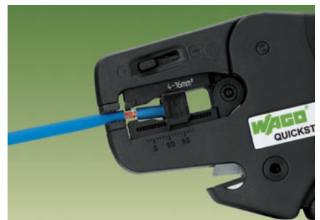
Stripping of wire.